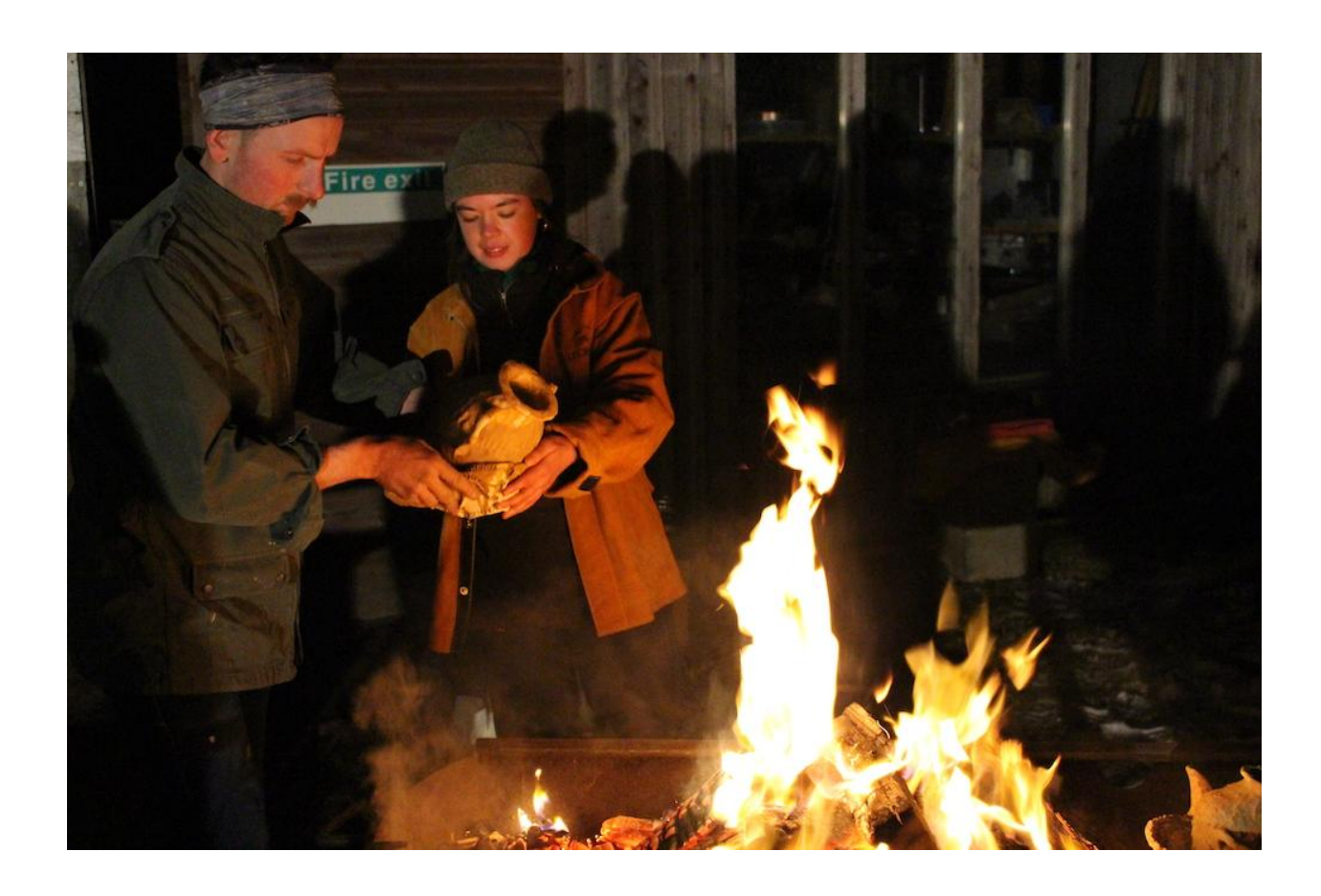
About the role

village is surrounded by farmland, moorland and hills, with hills The Buck and Tap O'Noth rising to the North and West, and Bennachie to the East. We are on the main road between towns Alford and Huntly. Lumsden is a 15 minute drive from the Cairngorms National Park, and a short drive to many castles, whisky trails and a wide range of outdoor facilities and pursuits. The North East coast has beautiful beaches and cliff walks, while more locally there are lots of historic sites to explore. The nearest city is Aberdeen. It is approx. one hour's drive to the south east with train stations within a 20 minute drive of SSW.